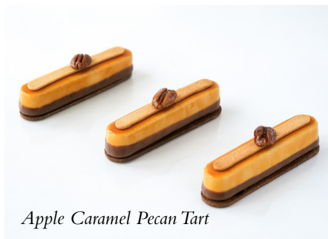
Apple Caramel Pecan Tart