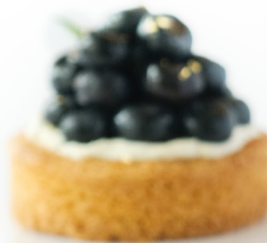
Blueberry Crème Fraîche Tart