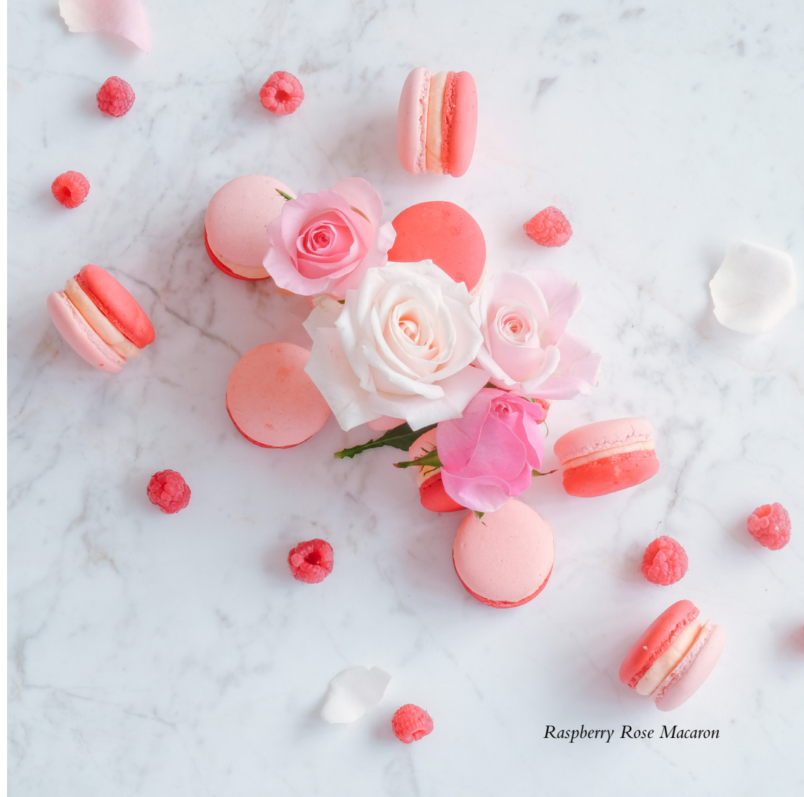
Raspberry Rose Macaron

All prices are times 1,000 in Vietnam Dong (VND) and are subject to service charge and then VAT