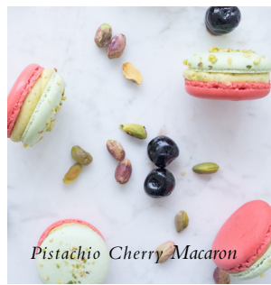
Pistachio Cherry Macaron