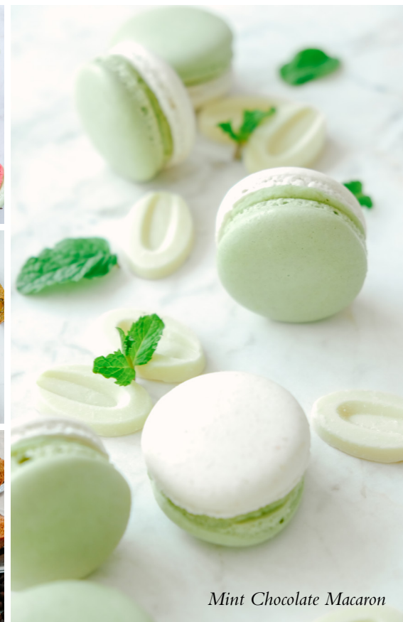
Mint Chocolate Macaron